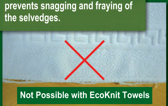
Not Possible with EcoKnit Towels

The unique construction allows the towel to expel water quickly and prevents snagging and fraying of the selvages.