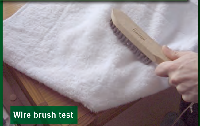
Wire brush test

Energy Saver! Reduce Energy up to 40% and Water by 15%